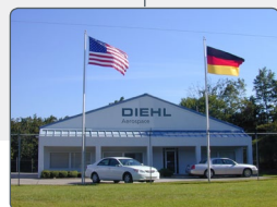
Sterrett Customer Support Center AMERICAS

12001 Highway 280 35147 Sterrett, Alabama United States