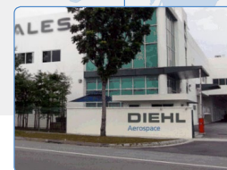
Singapore Customer Support Center ASIA PACIFIC

28 Changi North Rise Singapore 498755 Singapore