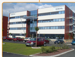
Toulouse Customer Service Center EMEA

ZAC de Saint Martin du Touch 6, Impasse Alice Guy, 31300 Toulouse France