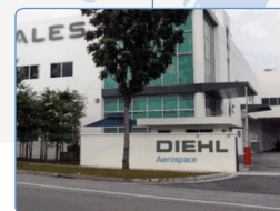
Singapore Customer Service Center ASIA PACIFIC

28 Changi North Rise Singapore 498755 Singapore