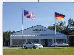
Sterrett Customer Service Center AMERICAS

12001 Highway 280 35147 Sterrett, Alabama United States