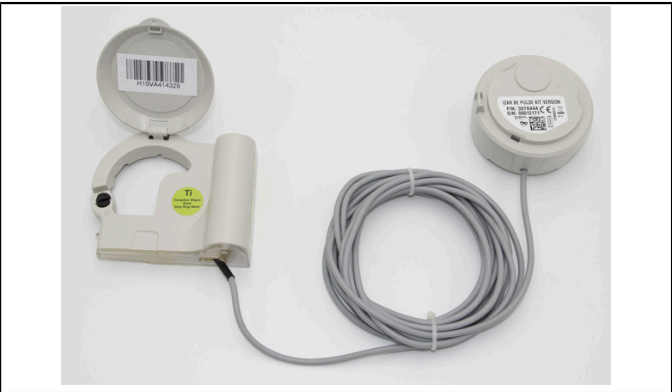
Kit IZAR BE PULSE + IZAR PULSE i

IZAR BE PULSE is also available as a factory-assembled kit with an IZAR PULSE i. The cable length can then vary between 4.95 and 5 meters due to the manufacturing tolerance. The kit is IP68 and can be submerged.