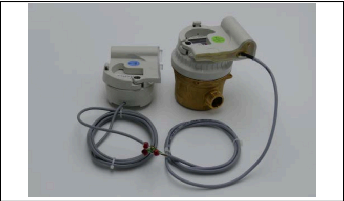
IZAR BE PULSE + IZAR RC i + ALTAIR V4 + IZAR PULSE i