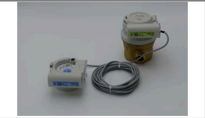
Kit IZAR BE PULSE + IZAR PULSE i + ALTAIR V4 + IZAR RC i