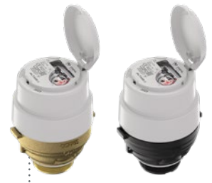
DN 20 brass & composite concentric