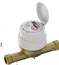
DN 20 brass in-line

The ALTAIR success story continues with a new product design which has a decisive impact on the environment. The new generation ALTAIR V5 provides you with volumetric technology at its best: excellent metrological performance and long-term measuring reliability. Suited for the most challenging environments. For efficient water management. For the reduction of non-revenue water. To conserve one of the world's most valuable natural resources: water.