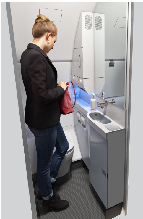
Pleasant feeling of space